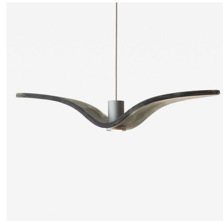
Shown in silver body / white canopy / smoke grey brokisglass

COLOR RENDERING . . . . . 90 CRI LAMP COLOR . . . . . 2700K LUMENS/WATT . . . . . 78.67 LUMINOUS FLUX . . . . . 118 lumens