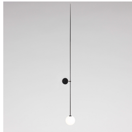
Shown in black patina / opal

The Mobile 10 Wall Sconce is a delicate structure balanced in perfect equilibrium. At one end of the sconce, an opal glass globe diffuser produces an inviting warm glow. The other end of the sconce features an elongated tail of black patinated brass for a sleek, minimalist expression.