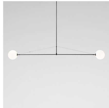
Shown in black patina / opal

LAMP COLOR . . . . . 2700K LUMENS/WATT . . . . . 177.78 LUMINOUS FLUX . . . . . 1600 lumens