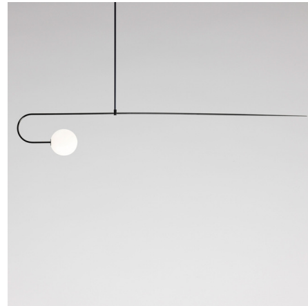
Shown in black patina / opal

LAMP COLOR . . . . . 2700K LUMENS/WATT . . . . . 88.89 LUMINOUS FLUX . . . . . 800 lumens