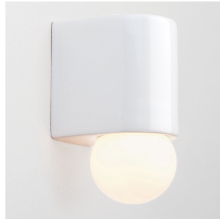
Shown in white / opal

LAMP COLOR . . . . . 2700K LUMENS/WATT . . . . . 125.00 LUMINOUS FLUX . . . . . 250 lumens