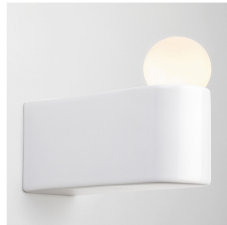
Shown in white / opal

Inspired by Bauhaus porcelain lights used in the 1930s, the Porcelain D2 Wall Sconce is made of slip-casted ceramic to provide a tough, resistant finish. The end result is a simple, elegant piece that creates a warm glow of light in any space. Due to the manufacturing process, each piece is unique, adding to the appeal. Includes paintable junction box cover for use in North America; not pictured.