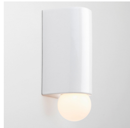
Shown in white / opal

Inspired by Bauhaus porcelain lights used in the 1930s, the Porcelain D3 Wall Sconce is made of slip-casted ceramic to provide a tough, resistant finish. The end result is a simple, elegant piece that creates a warm glow of light in any space. Due to the manufacturing process, each piece is unique, adding to the appeal. Includes paintable junction box cover for use in North America; not pictured.