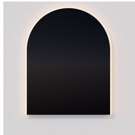
Shown in black / mirror

Designed in Italy, the Starlight Arched Tunable Touchless LED Mirror is a true work of art. With a hands-free infrared sensor, operating the mirror is as simple as a wave of your hand. Turn it on or off, adjust the brightness, and select your desired color temperature from 3000K-6000K by using the motion sensor.