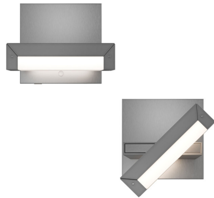
Shown in brushed nickel / white

LAMP LIFE . . . . . 50000 hours COLOR RENDERING . . . . . 90 CRI LAMP COLOR . . . . . CCT Select LUMENS/WATT . . . . . 25.26 LUMINOUS FLUX . . . . . 293 lumens