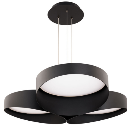
Shown in black / white