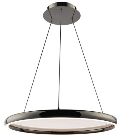
Shown in black chrome / white