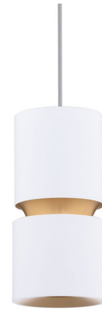
Shown in white / aged brass