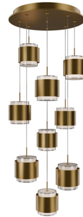
Shown in aged brass / white

LAMP LIFE . . . . . 50000 hours COLOR RENDERING . . . . . 90 CRI LAMP COLOR . . . . . CCT Select LUMENS/WATT . . . . . 429.00 LUMINOUS FLUX . . . . . 3861 lumens