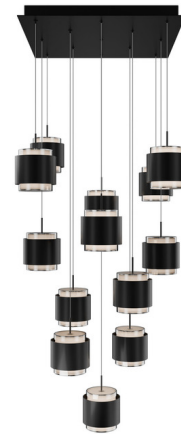
Shown in black / white

LAMP LIFE . . . . . 50000 hours COLOR RENDERING . . . . . 90 CRI LAMP COLOR . . . . . CCT Select LUMENS/WATT . . . . . 619.67 LUMINOUS FLUX . . . . . 5577 lumens