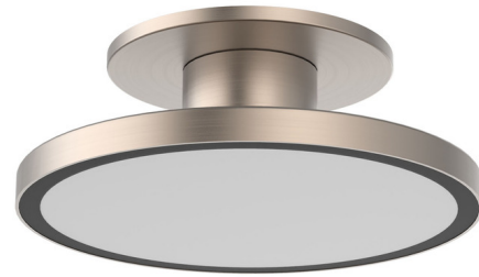
Shown in brushed nickel / white