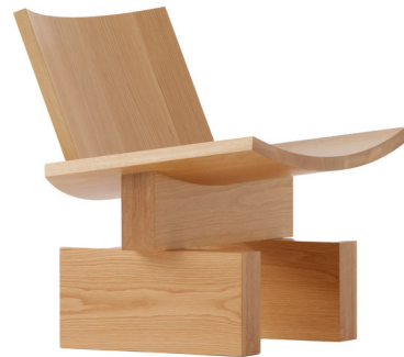
Shown in natural oak

The Plane Lounge Chair features a bold design with a structure of geometric wooden pieces in a seemingly impossible balancing act. Made of solid wood with a cantilevered seat and internal joinery, Plane is a statement piece designed to be passed down through generations. The gently curved seat and back contrast the linear legs for a striking geometric look.