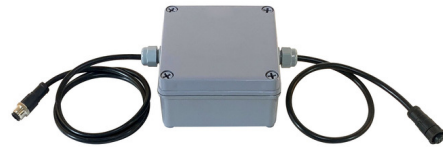
Shown in grey

The watertight Junction Box is especially designed for lighting in wet and damp locations. The Junction Box comes standard with 8 feet of outdoor cable and both male and female barrel connectors providing easy, safe, and reliable connections for 24V low voltage luminaires. Included with the Junction Box is one WiZ Pro type Bridgebox allowing for 5 Channel wireless control of the TruColor RGBTW luminaire. This box is approved for indoor and outdoor usage and complies with all the requirements of UL1241 and the National Electric Code. Available in two wattage options: 5W5 - 5 watts RGB and 5 watts Tunable White 5W7 - 5 watts RGB and 7 watts Tunable White