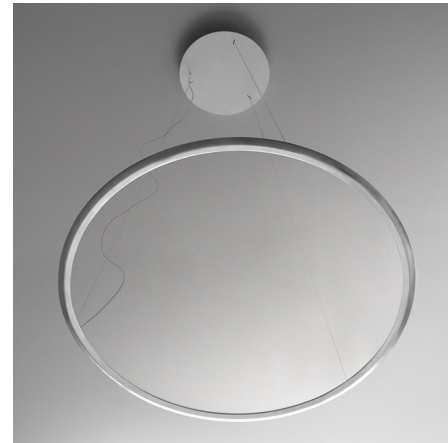
Shown in polished aluminum / transparent