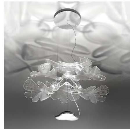
Shown in polished aluminum / transparent

PRODUCT DIMENSIONS . . . . . Canopy: 9.8" diameter LAMP LIFE . . . . . 50000 hours COLOR RENDERING . . . . . 93 CRI LAMP COLOR . . . . . 3000K LUMENS/WATT . . . . . 63.73 LUMINOUS FLUX . . . . . 2651 lumens