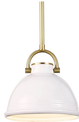
Shown in brass / white

The Eloise Pendant combines beauty and utility for a classic shape that's perfect for a coastal bungalow or modern farmhouse abode. A timeless ceramic shade is tailored to perfection and offset with Natural Brass details to add a warm contrast. Place the Eloise over your kitchen island to complement your decor.