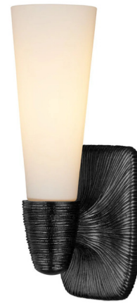
Shown in oil rubbed bronze / white

Drawing inspiration from the tidy strands of an elegant chignon, the Bonaz Wall Sconce is made of cast brass with dynamic, radiating texture. A white glass shade creates a warm glow that compliments the metal finish.