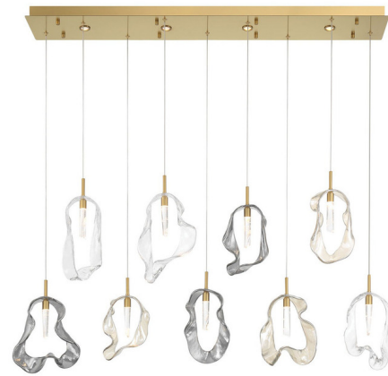
Shown in gold / clear

PRODUCT DIMENSIONS . . . . . Min/Max Height: 38" / 114" COLOR RENDERING . . . . . 90 CRI LAMP COLOR . . . . . 3000K LUMENS/WATT . . . . . 968.50 LUMINOUS FLUX . . . . . 1937 lumens