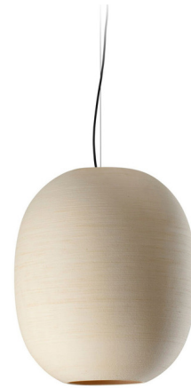
Shown in black / natural

The Tierra Pendant, designed by Hector Serrano, combines the beauty of nature with the innovation of 3D printing. The shade is made of PLA (a bioplastic of vegetable origin) mixed with recycled pine cellulose. This gives it a random and imperfect texture for an artisan look. The shapes in this collection evoke the warmth of beehives in a subtle and synthetic way. When lit, the designs transform into luminous sculptures thanks to their translucency. The light can be placed individually or combined with the other models in the collection to create compositions that fill the space with light and presence.