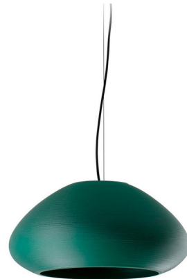
Shown in black / green

The Mar Pendant, designed by Hector Serrano, is inspired by the shapes of sea urchin shells. The shade is made from recycled fishing nets, hence the characteristic green shade. A combination of sustainability and 3D printing. The light can be placed individually or combined with the other models in the collection to create compositions of unique pieces that illuminate with style and an environmental conscience.