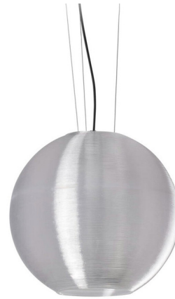
Shown in white / transparent

The Aire Pendant blends technology and sustainability. The shade is made of recycled PETG and has a transparent, textured finish. The 3D-printed shapes are like air bubbles that fill the space, giving it personality and elegance. Thanks to the crystalline appearance and surface texture, the light is magically diffused through the shade. The Aire can be used individually or with other luminaires from the collection to create unique light compositions.