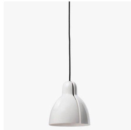
Shown in gloss black / white

The Venice Pendant designed by Adolfo Abejn is modern, versatile and minimalist. The aim of this collection is to create comfortable spaces through handmade work and a good choice of materials. Its lampshade is made of ceramic and has been handcrafted in a workshop in Barcelona and, thanks to its design, it fits perfectly in the lamp holder. The Venice will not go unnoticed, it is a great solution for interior lighting.