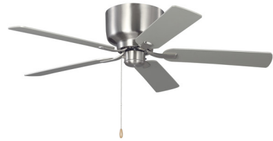
Shown in brushed steel / brushed steel / american walnut

Generation Lighting's Linden Hugger Ceiling Fan joins a family defined by its reliable performance and impressive value. The three-speed, pull chain motor with manual reverse switch optimizes year-round performance. The Linden Hugger 52 inch mounts flush to the ceiling, making it ideal for accenting smaller spaces or low ceilings. The Linden is compatible with a light kit. Midnight Black, Bronze, and Brushed Steel finishes have reversible American Walnut Blades.