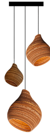
Shown in black / natural