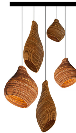
Shown in black / natural

The Hive Mixed Cluster Circular Scraplight Pendant is handmade from re-purposed cardboard boxes and features a non-toxic fire retardant treatment. The asymmetrical shades create dynamic interest. Size will vary slightly due to the handmade nature of the pendant. Perfect for a dining room or kitchen. Includes these Hive and Nest Pendant Sizes: Nest 2x24.4 inch High, Hive 9.1 inch Wide, Hive 11.8 inch Wide, Hive 15 inch Wide