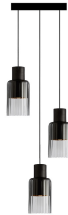
Shown in charcoal / smoke