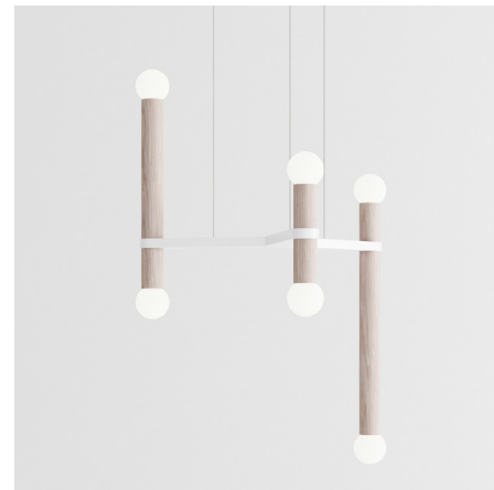
Shown in white / white oak

Inspired by the dynamic bonds of atomic structures, the Molecule Chandelier explores the intersection of nature, design, and illumination. Based in the patterns found in molecular forms, this sculptural chandelier is composed of plated Y-shaped connections that form the bonds in a larger whole. Choose between sizes and finishes to suit any architectural context. Note: Dimmable with ELV or 0-10V Dimmers.