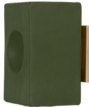
Shown in brass / ivy

The Artist Edition Luca Wall Sconce is part of the Terra series and was made in collaboration with ceramicist Danny Kaplan. It features a rectangular clay shade with a circular indentation that extends from the wall by sleek brass mounting hardware. Note: Due to the handmade nature of this product, dimensions may vary within one inch.