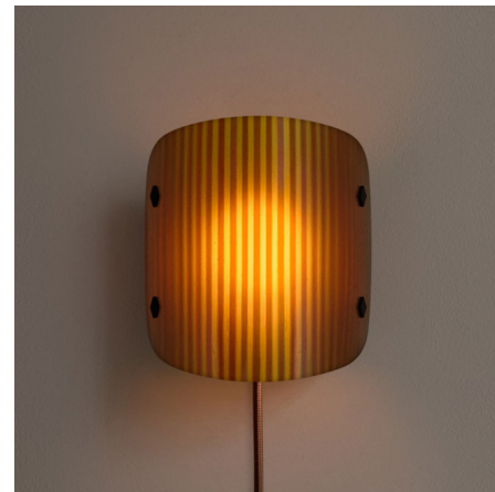
Shown in blackened brass / zinnia stripes

PRODUCT DIMENSIONS . . . . . Cord Length: 192" LAMP LIFE . . . . . 50000 hours COLOR RENDERING . . . . . 98 CRI LAMP COLOR . . . . . 3000K LUMENS/WATT . . . . . 80.00 LUMINOUS FLUX . . . . . 1200 lumens