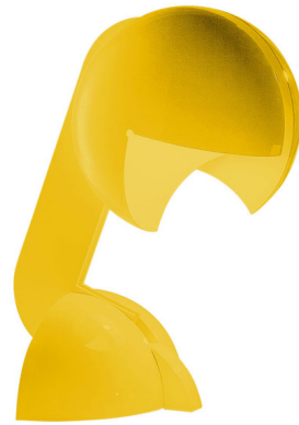
Shown in yellow

The Ruspa Table Lamp takes its name from the Italian word for bulldozer, a reference to its moveable arms and reflectors that recall the look of a bulldozer's front blade and hydraulic arms. The two halves of the reflector shade can be raised and lowered independently to direct light upwards or downwards, and the arm tilts backwards and forwards. Originally designed in 1968, Ruspa is a mid-century Italian classic that will stand out in any space. On/off switch on cord.