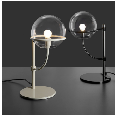
Shown in ivory / transparent

The Lyndon Outdoor Table Lamp, designed by Vico Magistretti in 1977, is perfect for those who love simple, geometric shapes masterfully combined to create the perfect piece. The candelabra style body is paired with a transparent polycarbonate globe, creating a striking presence anywhere it's placed. On/Off switch located on cord. IP23 rated for outdoor locations.