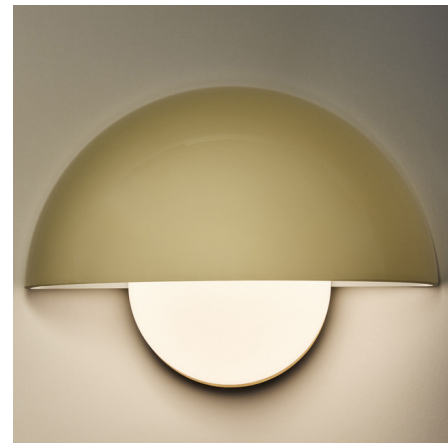
Shown in oil rubbed bronze / cased fume

Within the shell of an oyster and out of sight of the world, a grain of sand is turned into a pearl, resulting in one of nature's most opulent artifacts. The Pearl Wall Sconce is beauty from within. Handblown Italian glass forms an outer shell that masks an internal handblown pearl. Layered and rich, Pearl will take you back to the elegance of the 80s. The sconce's peekaboo shape will keep you looking.