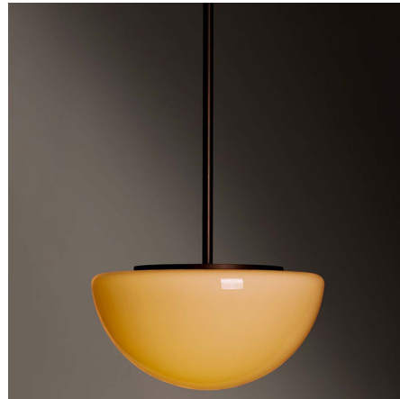
Shown in oil rubbed bronze / cased fume

PRODUCT DIMENSIONS . . . . . Min/Max Height: 11" to 44" LAMP LIFE . . . . . 50000 hours COLOR RENDERING . . . . . 90 CRI LAMP COLOR . . . . . 2700K LUMENS/WATT . . . . . 27.27 LUMINOUS FLUX . . . . . 300 lumens