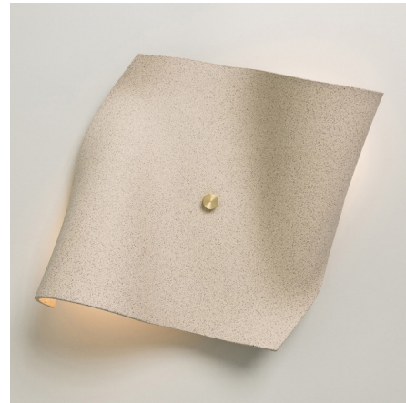
Shown in sand

Inspired by the soft waves of a sailcloth, the Shan Ceiling Light / Wall Sconce transforms the ceiling into a canvas of quiet minimalism. Its origami-like ceramic form creates an interplay of light and shadow overhead or when used as a wall sconce. Perfect for adding a warm glow in a bedroom, bringing character to a hallway, or adding style to a mudroom. METALLIC GLAZE AGING AND VARIATION The Obsidian and Graphite glazes contain reactive metallic compounds that naturally oxidize, causing their hue and sheen to evolve over time. Expect soft mattifying, darker tones, or a gentle reduction in luster, beautiful changes that make each handmade piece uniquely alive. These subtle shifts are part of the glaze's natural character, not flaws.