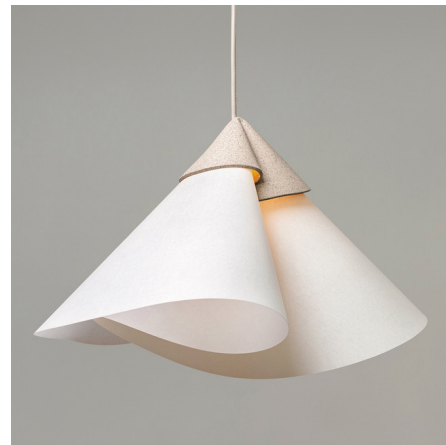
Shown in sand / lantern white parchment

PRODUCT DIMENSIONS . . . . . Cord: 10ft COLOR RENDERING . . . . . 95 CRI LAMP COLOR . . . . . Warm Dim LUMENS/WATT . . . . . 90.91 LUMINOUS FLUX . . . . . 1000 lumens