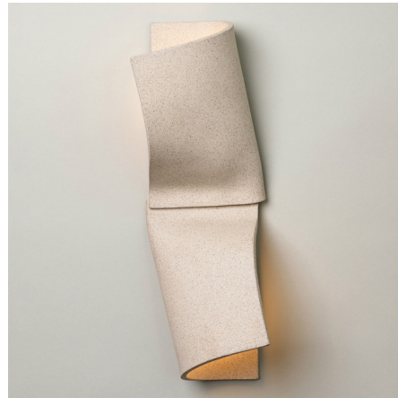
Shown in sand

Like the organic beauty of origami, the Double Shai Sconce exudes a structured weightlessness. Each fold and curve reflects a balance of complexity and ease, transforming the wall into a canvas of light and shadow. Use these to flank a bathroom mirror, add sculptural interest to a hallway, or provide a graceful accent beside a bed. METALLIC GLAZE AGING AND VARIATIONThe Obsidian and Graphite glazes contain reactive metallic compounds that naturally oxidize, causing their hue and sheen to evolve over time. Expect soft mattifying, darker tones, or a gentle reduction in luster, beautiful changes that make each handmade piece uniquely alive. These subtle shifts are part of the glaze's natural character, not flaws.