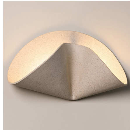
Shown in sand

Captured in a moment of stillness, the Shado Wall Sconce embodies the weightless beauty of origami. The upward-turned curves direct light with intention, creating a soft glow across a wall. B>METALLIC GLAZE AGING AND VARIATIONThe Obsidian and Graphite glazes contain reactive metallic compounds that naturally oxidize, causing their hue and sheen to evolve over time. Expect soft mattifying, darker tones, or a gentle reduction in luster, beautiful changes that make each handmade piece uniquely alive. These subtle shifts are part of the glaze's natural character, not flaws.