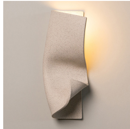
Shown in sand

Like the organic beauty of origami, the Shai Sconce exudes a structured weightlessness. Each fold and curve reflects a balance of complexity and ease, transforming the wall into a canvas of light and shadow. Use these to flank a bathroom mirror, add sculptural interest to a hallway, or provide a graceful accent beside a bed. Note: Must use a 4in x 2in junction box with holes for 6-32 set screws. METALLIC GLAZE AGING AND VARIATION The Obsidian and Graphite glazes contain reactive metallic compounds that naturally oxidize, causing their hue and sheen to evolve over time. Expect soft mattifying, darker tones, or a gentle reduction in luster, beautiful changes that make each handmade piece uniquely alive. These subtle shifts are part of the glaze's natural character, not flaws.