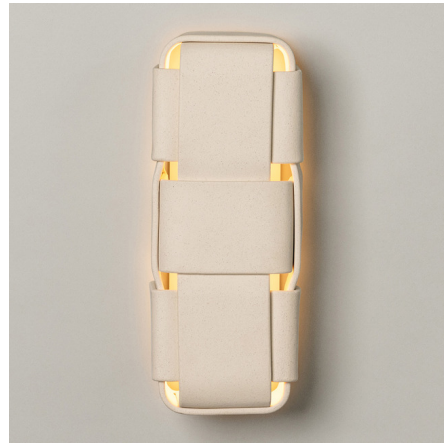
Shown in bone

A study in tension and pattern, the Stria 3 Wall Light draws inspiration from weaving, where elegant shape emerges through repetition. Hand-placed ceramic strips create a strong lattice of light and shadow, creating warmth and dimension. Perfect for shining a soft glow in a reading nook or adding texture along a hallway. Install vertically or horizontally. METALLIC GLAZE AGING AND VARIATION The Obsidian and Graphite glazes contain reactive metallic compounds that naturally oxidize, causing their hue and sheen to evolve over time. Expect soft mattifying, darker tones, or a gentle reduction in luster, beautiful changes that make each handmade piece uniquely alive. These subtle shifts are part of the glaze's natural character, not flaws.