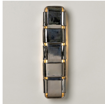
Shown in obsidian

A study in tension and pattern, the Stria 5 Wall Light draws inspiration from weaving, where elegant shape emerges through repetition. Hand-placed ceramic strips create a strong lattice of light and shadow, creating warmth and dimension. Perfect for shining a soft glow in a reading nook or adding texture along a hallway. METALLIC GLAZE AGING AND VARIATION The Obsidian and Graphite glazes contain reactive metallic compounds that naturally oxidize, causing their hue and sheen to evolve over time. Expect soft mattifying, darker tones, or a gentle reduction in luster, beautiful changes that make each handmade piece uniquely alive. These subtle shifts are part of the glaze's natural character, not flaws.