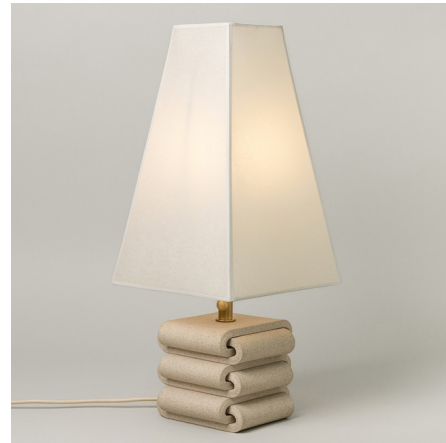
Shown in sand / lantern white parchment

LAMP COLOR . . . . . 2200K LUMENS/WATT . . . . . 80.00 LUMINOUS FLUX . . . . . 480 lumens