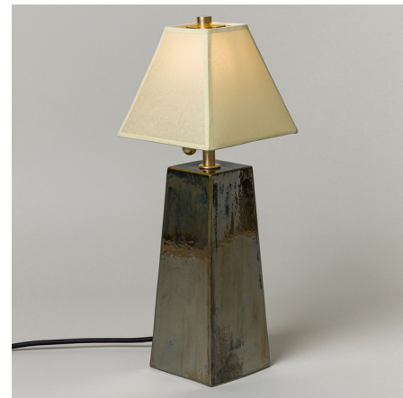
Shown in obsidian / faint green parchment

LAMP COLOR . . . . . 2700K LUMENS/WATT . . . . . 115.00 LUMINOUS FLUX . . . . . 460 lumens