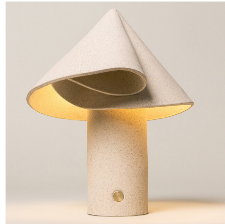
Shown in sand