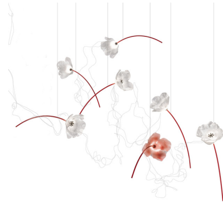
Shown in red / prisma