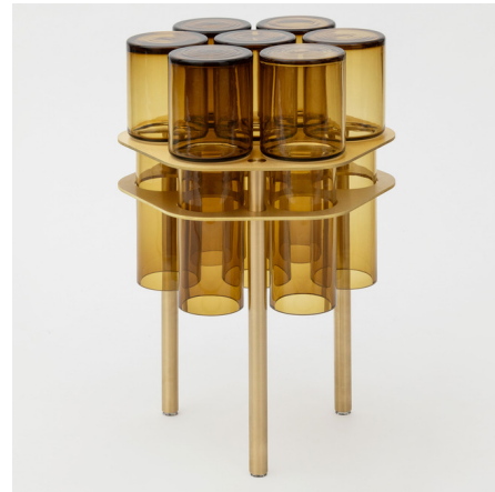
Shown in brushed brass / olivin

The Field Table features a collection of glass cylinders grouped together to form a geometric service. The cylinders nest into holes within the metal frame, set apart at the perfect distance to provide a functional tabletop while still reading as separate objects. Sleek cylindrical legs support the tabletop and echo the cylindrical motif throughout the piece.