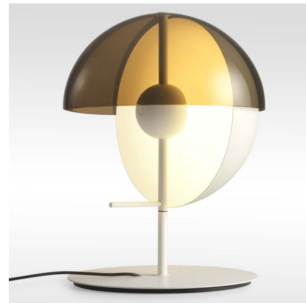
Shown in white / smoke

COLOR RENDERING . . . . . 90 CRI LAMP COLOR . . . . . 2700K LUMENS/WATT . . . . . 111.34 LUMINOUS FLUX . . . . . 913 lumens